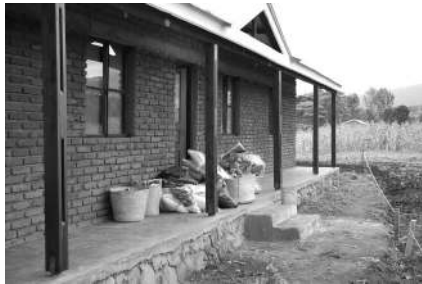
The first completed Young Men's House on move in day! The second Young Men's House is currently under construction.

As a result of your generous support, we have been able to continue to expand our programs in the Oldeani area, while remaining faithful to our core mission: to provide support for the Rift Valley Children's Village and the community-based programs that are closely tied to the life of families in the Oldeani area of Northern Tanzania.